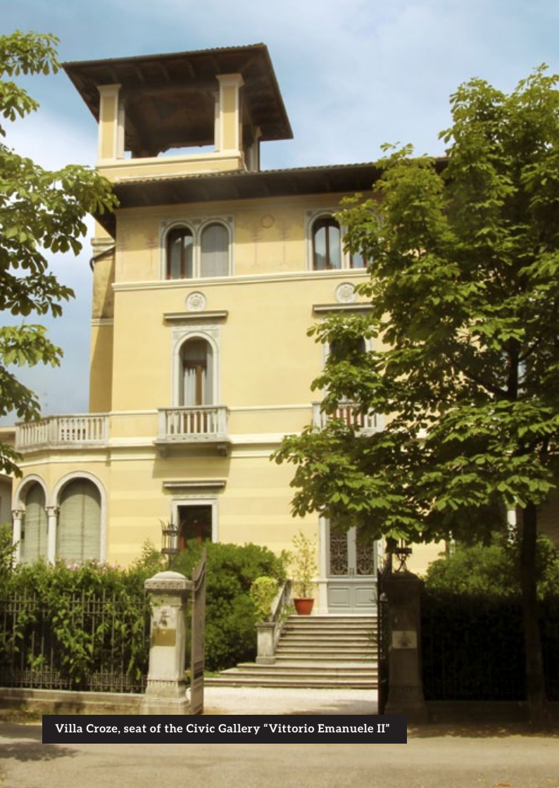
Villa Croze, seat of the Civic Gallery "Vittorio Emanuele II"